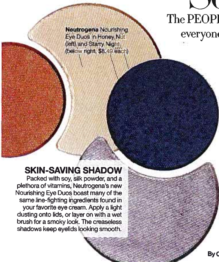
Neutrogena Nourishing Eye Duos in Honey Nut (left) and Starry Night (below right, $8.49 each)